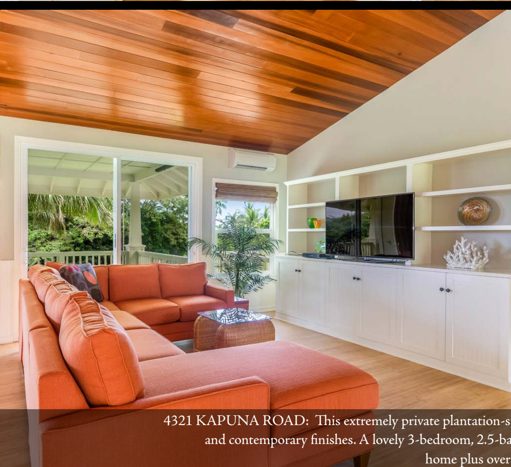
4321 KAPUNA ROAD: This extremely private plantation-style home offers the best of traditional Hawaiian design and contemporary finishes. A lovely 3-bedroom, 2.5-bathroom, fully air-conditioned and beautifully renovated home plus oversized garage with private office on 2.3 acres. $1,495,000