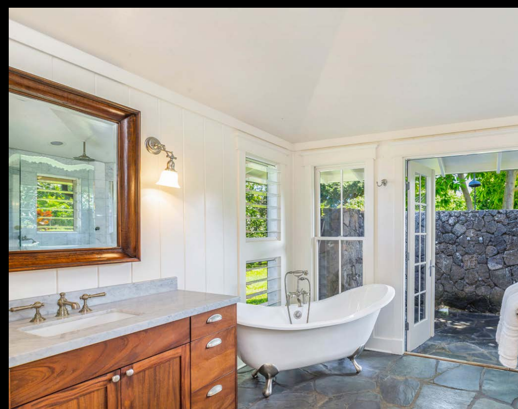
4327 KAPUNA ROAD: An exceptional and rare compound property with ocean views and established fruit tree orchard on the North Shore. Offering includes an elegant plantation-style main home, private guest house, spa pavilion plus building rights for another primary home. $3,000,000