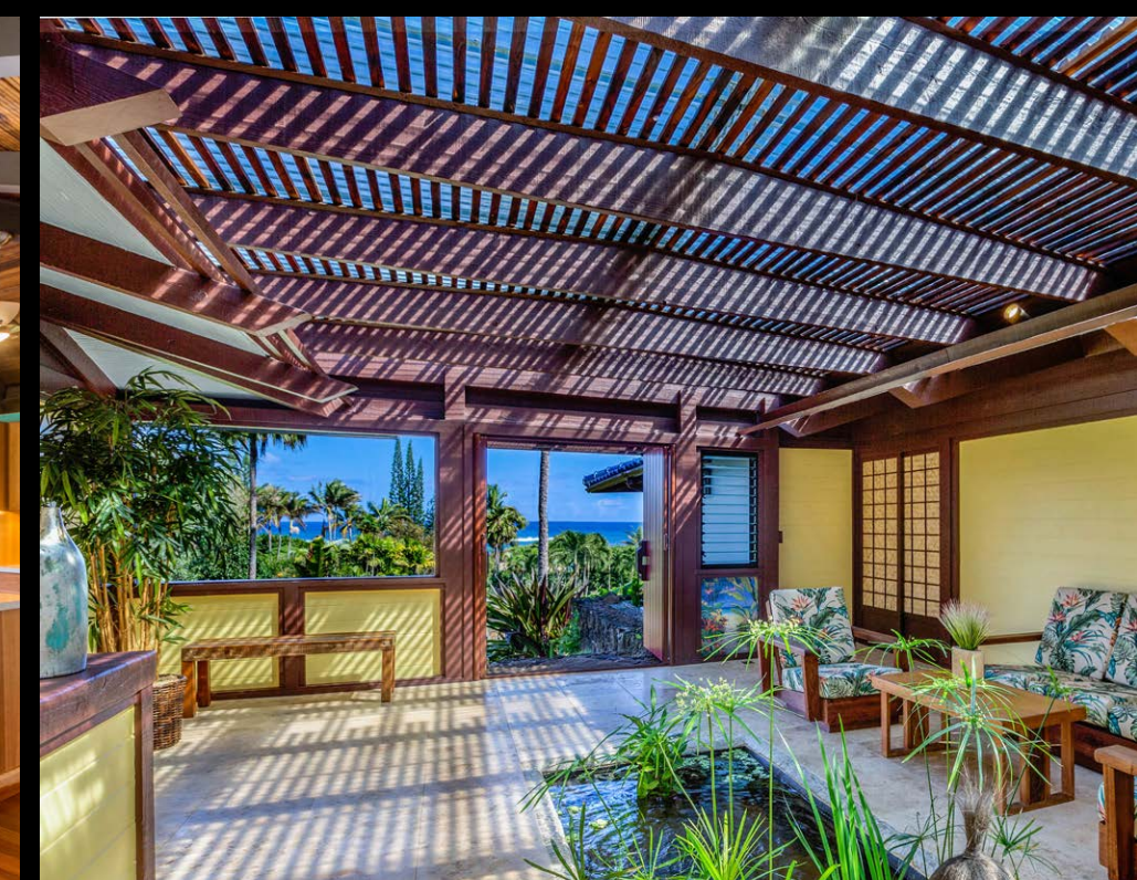
4933 ALIOMANU ROAD: White water ocean views, terraced pod-like living spaces, extraordinary craftsmanship and traditional Asian/Polynesian design are the characteristics that define this exquisite tropical seaside compound, Mahina Kai – “Moonlight Over the Sea.” $2,750,000