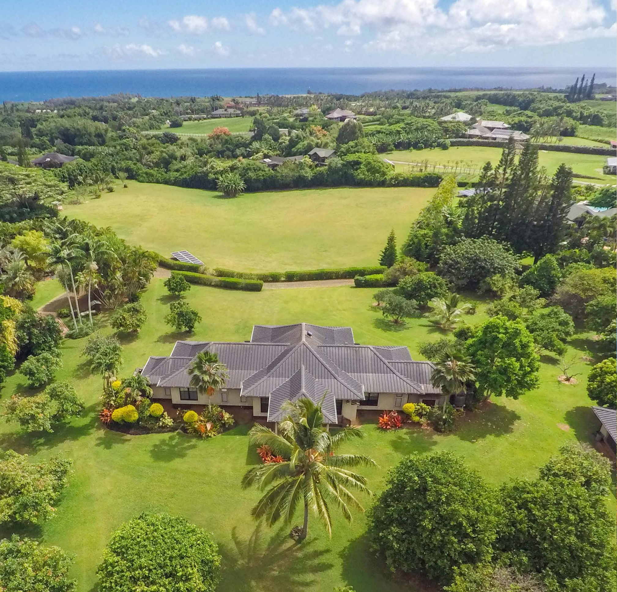
LUXURY COMPOUND ON 6.57 ACRES