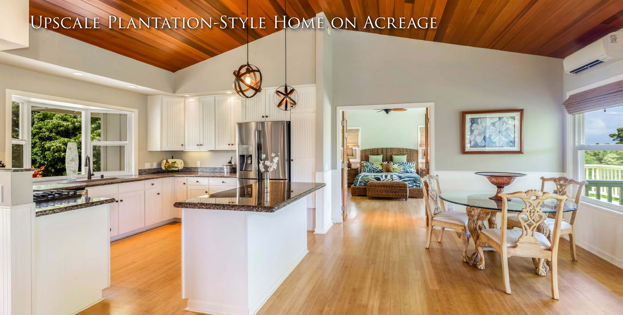
UPSCALE PLANTATION-STYLE HOME ON ACREAGE