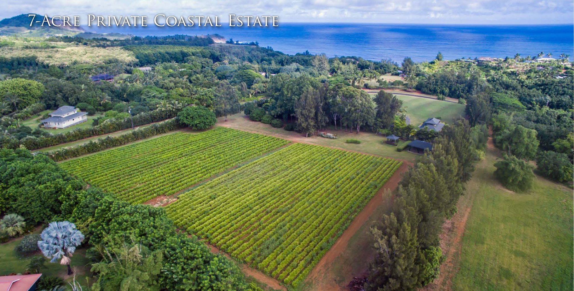
7-ACRE PRIVATE COASTAL ESTATE