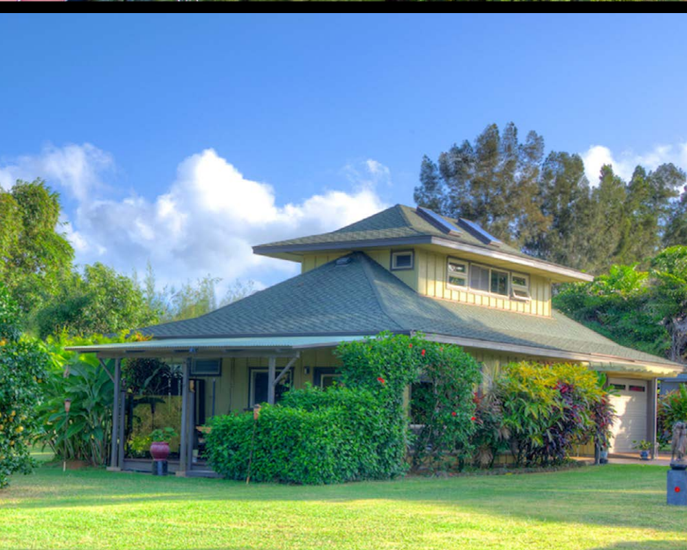
4235 N. WAIKALUA ROAD: Remarkable, elevated 7-acre property with ocean and mountain views abound. Enjoy the serenity of country living as well as the sights and sounds of the sea from this rare coastal homesite with mature landscaping and beautiful existing structures. $1,895,000