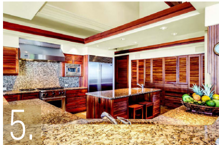
5. Working Coffee Farm in Holualoa by Frank Schenk & Nicolaas Schenk page 44