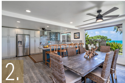
2. Waimanalo Beachfront Paradise by Annie Kwock page 9