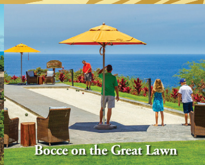
Bocce on the Great Lawn