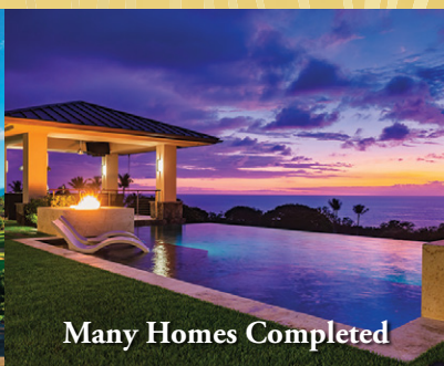
Many Homes Completed