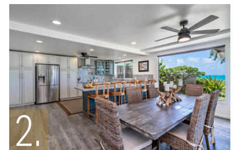
2. Waimanalo Beachfront Paradise by Annie Kwock page 9