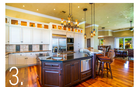
3. 65 Wili Okai Way by Greg Burns page 30