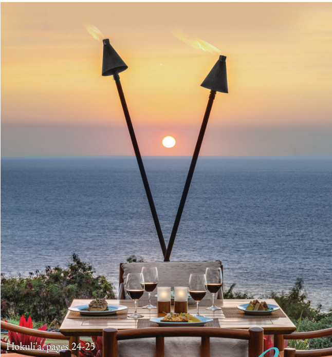
Hokulua, pages 24-25