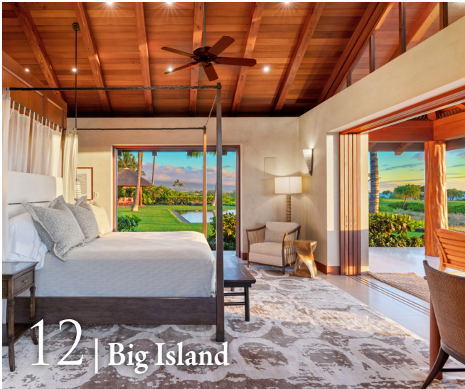
12 | Big Island