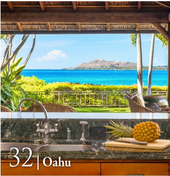
32 | Oahu