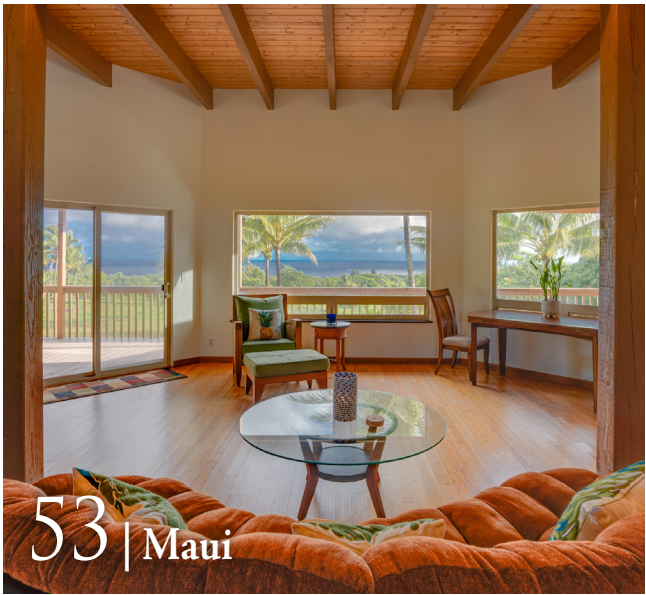
53 | Maui