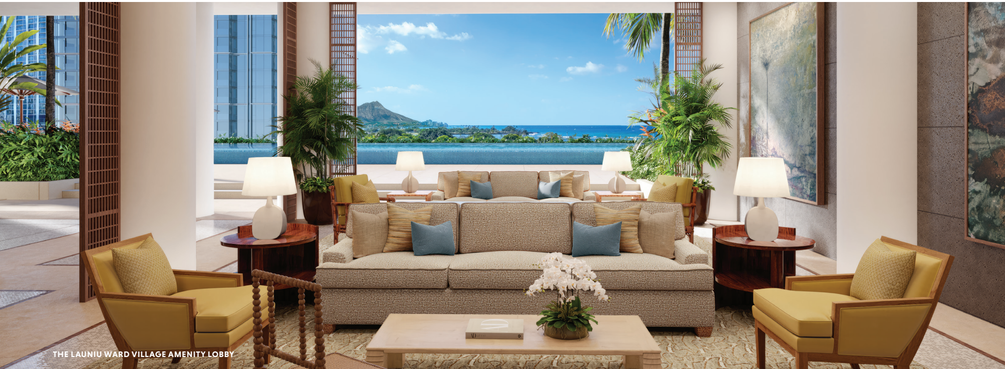
THE LAUNIU WARD VILLAGE AMENITY LOBBY

At The Launiu Ward Village, elevated amenities allow residents to relax, unwind, and celebrate. Studio, One, Two, and Three Bedroom Residences