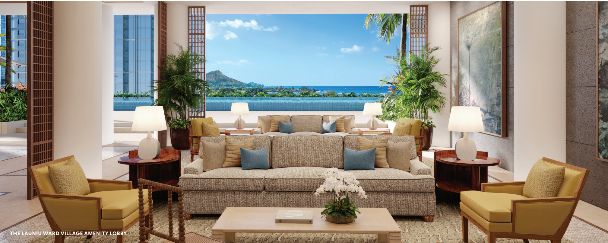
THE LAUNIU WARD VILLAGE AMENITY LOBBY