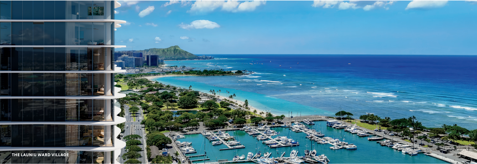
THE LAUNIU WARD VILLAGE

The Launiu Ward Village residences are an artful blend of inspired design and timeless sophistication. Expansive views extend the interiors and a host of amenities provide abundant space to gather with family and friends.