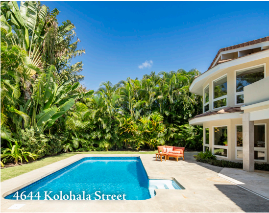
4644 Kolohala Street

1727 Kumakani Loop | Sold at $3,485,000 FS 121 Maono Place | Sold at $3,125,000 FS 2029 Kuola Street | Sold at $2,950,000 FS 4644 Kolohala Street | Pending In-Escrow