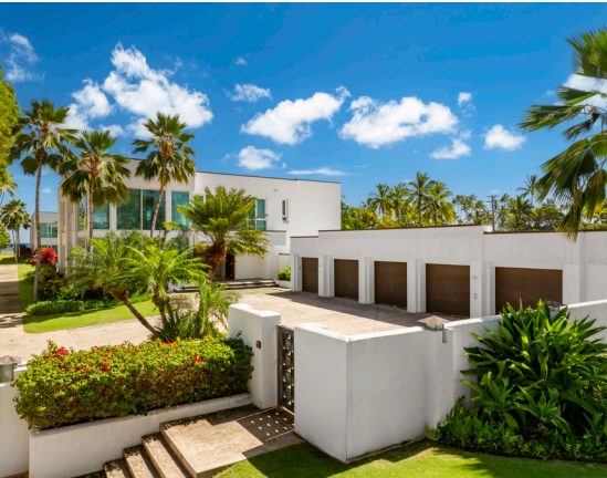
Middle and right photos are virtually staged.