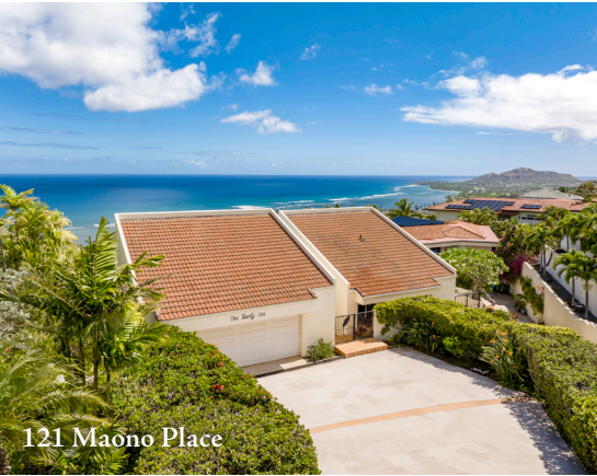
121 Maono Place

Coastal Living & The Perfect Location! Stunning 4-BR, 4.5-BA residence located on one of Honolulu's most coveted streets in the premier neighborhood of Diamond Head, offers numerous custom features. The seamless connection to the outdoor lounge & BBQ veranda, tiled pool & grassy lawn areas w/ mature trees & landscape is what life in Hawaii is all about. A cozy Primary Suite w/ adjoining outdoor balcony provides coastal views of azure waters by day & sunset glows at night. Three additional bedroom suites all w/ baths provide ample room for family or visiting guests. This premiere location is merely minutes to sandy beaches, parks, farmers market, restaurants, shopping, & more!