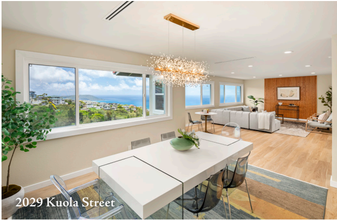
2029 Kuola Street