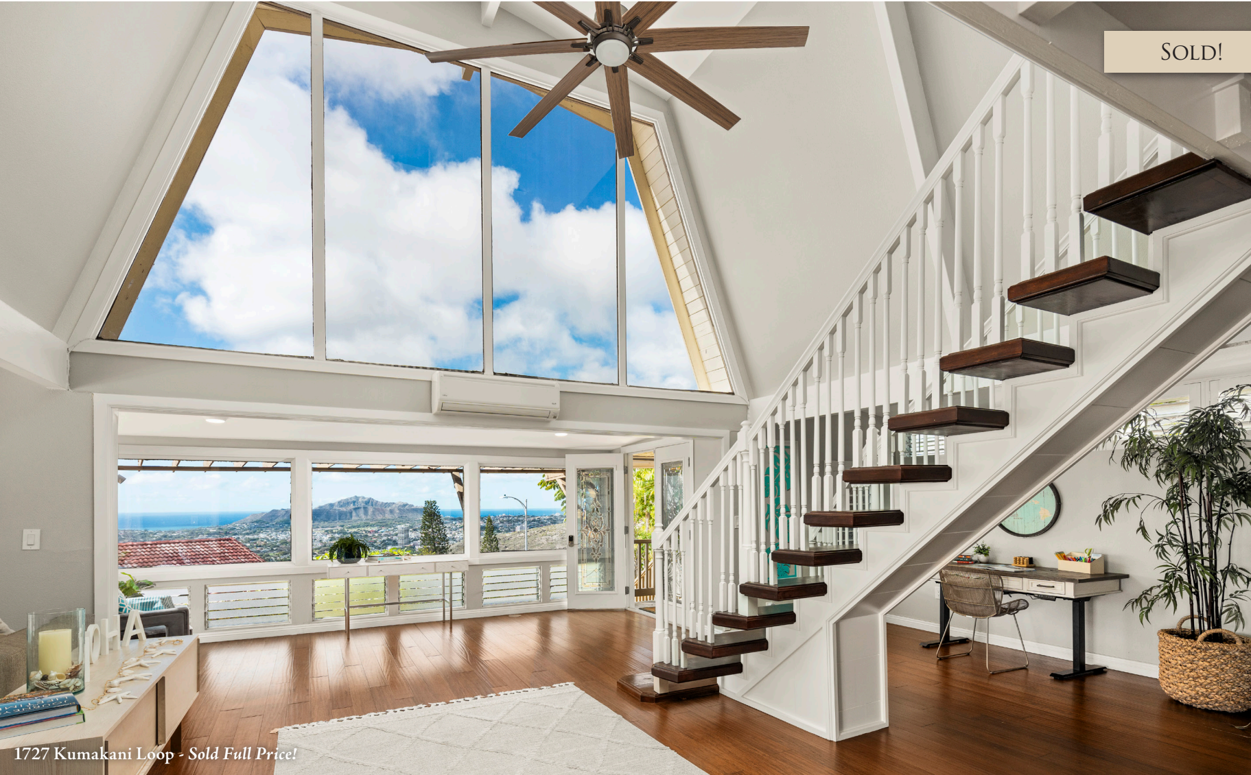
1727 Kumakani Loop - Sold Full Price!