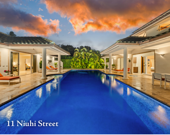
11 Niuhi Street

TRIPLE THE VIEWS, TRIPLE THE SPACE, TRULY ONE OF A KIND. Colony Surf's most unique offering, this expansive triple unit residence blends elegant coastal living with unrivaled views from sunrise to sunset. Breezy, welcoming interiors open to the ocean, creating a peaceful retreat above Waikiki's iconic shoreline. Whether enjoyed as one grand home or separate private suites, the lifestyle here is unmatched. Beach days, ocean activities and world class dining sit right outside your door. A rare chance to own a signature residence in an iconic coastal setting. Opportunities of this caliber rarely come to market.