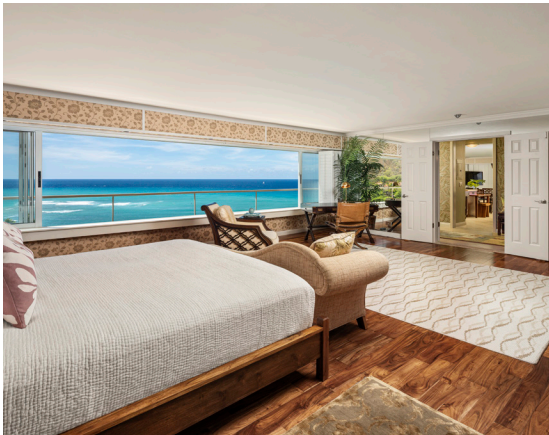
2895 KALAKAUA AVENUE #1403, 1404, 1405

Honolulu, Oahu | 2,372 SQFT | 3BR/3BA MLS# 202516952 | $5,795,000