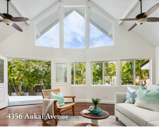
4356 Aukai Avenue

4462 Kahala Avenue | Sold at $8,880,000 FS 11 Niuhi Street | Sold at $4,550,000 FS 471 Maono Loop | Sold at $3,400,000 FS 4356 Aukai Avenue | Sold at $3,205,000 FS