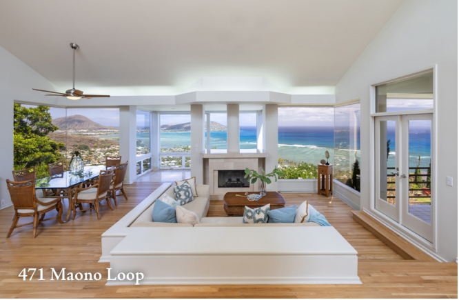
471 Maono Loop