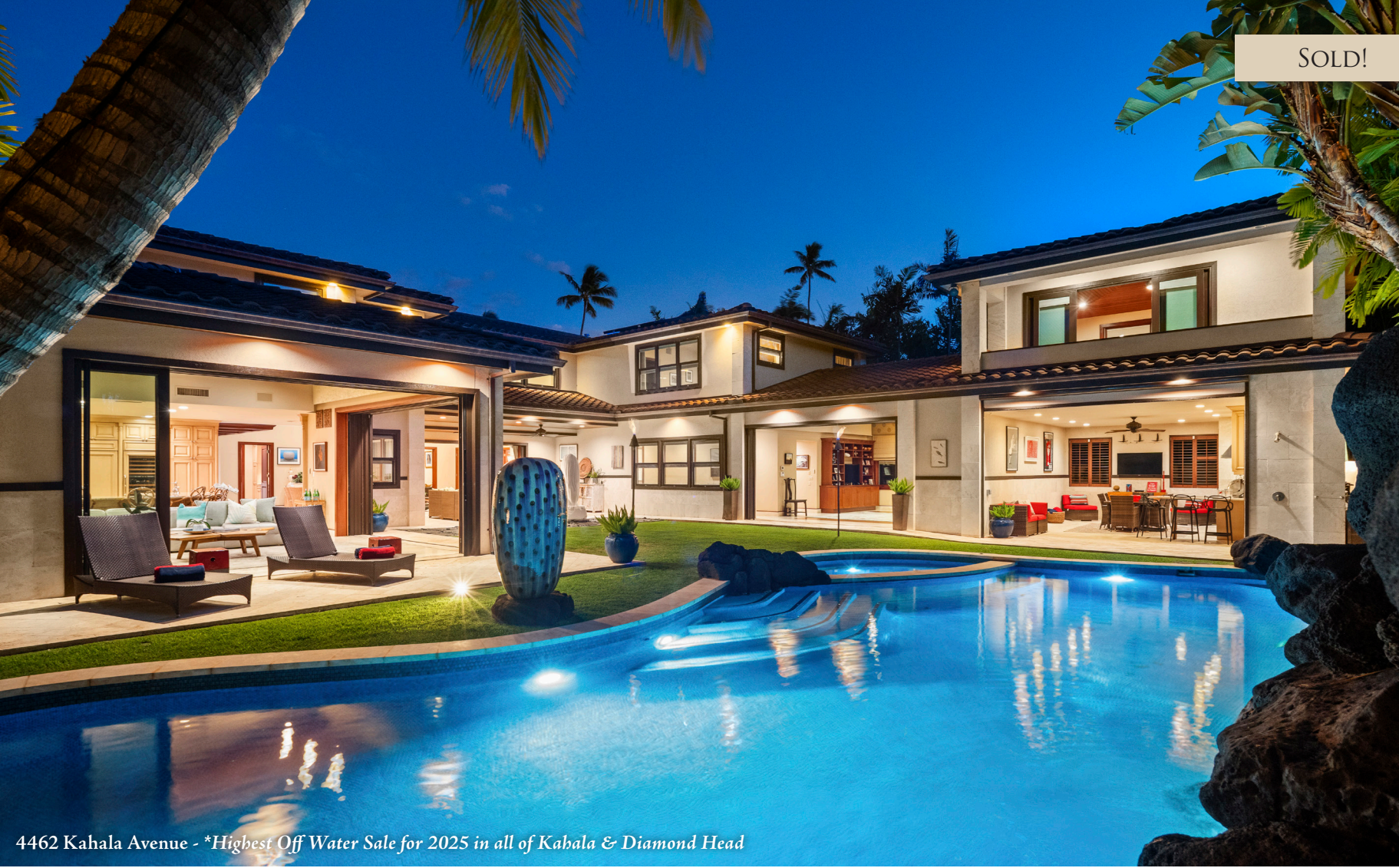
4462 Kahala Avenue - *Highest Off Water Sale for 2025 in all of Kahala & Diamond Head